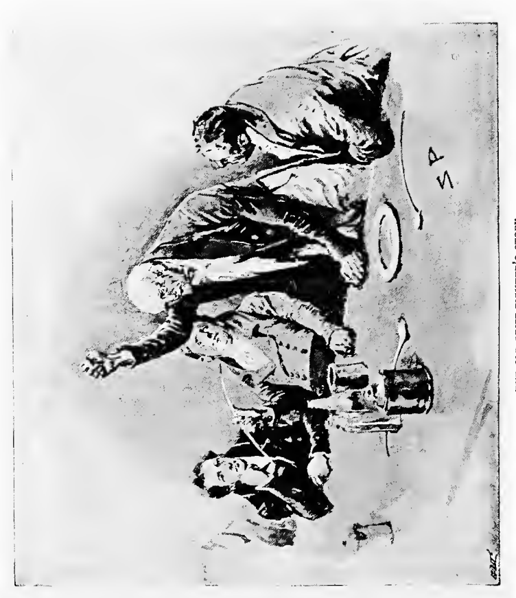
THE OLD PRIZE-FIGHTER'S STORY.